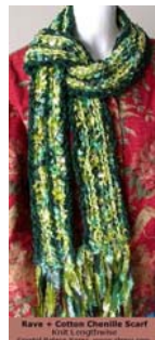
Cotton Chenille + Rave Scarf 2 balls CC + 1 Rave