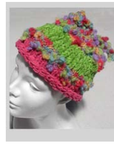
Cotton Chenille + Nubbles Hat 1 ball each color