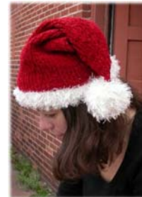
Cotton Chenille + Splash Hat 2 balls + 1 Splash