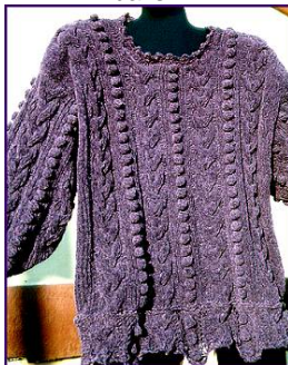
Cables & Bobbles 18 balls