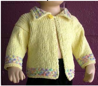
Cotton Chenille Baby Cardigan 3 balls + 1 print color for trim