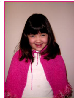
Child's Capelet – Squiggle trim 3-7 balls + 1-2 balls