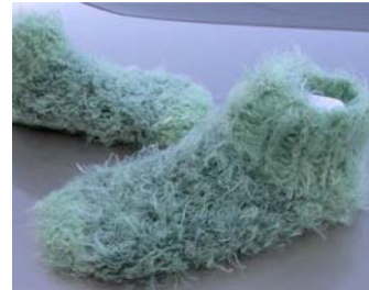
Cotton Chenille + Whisper Slippers 2 balls CC + 1 ball Whisper