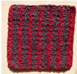
Crocheted Cotton Chenille Washcloth 1 ball each color = 4 cloths