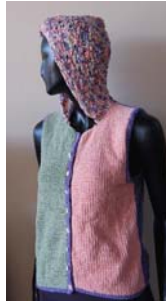
CC Vest w/ optional hoodie - 5 balls CC + 2 Blippity