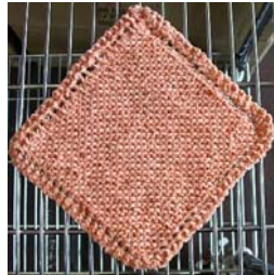
Knit Cotton Chenille Washcloth 1 ball = 2 cloths