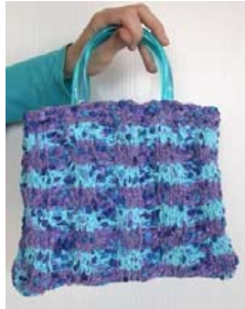
Cotton Chenille + Blippity Bag 2 + 2 balls