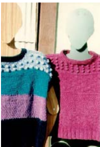
Cotton Chenille Sampler Vest 7 balls (or 8 if knit in 4 colors)