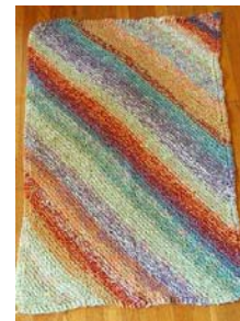
Cotton Chenille Baby Blanket 12 balls – held double

There are 100s more free patterns on our web site and more are being added regularly – check the What's New page link at the top of any page at www.straw.com