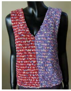
Cotton Chenille + Blippity V Vest 4 balls Cotton Chenille + 3 balls