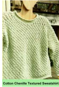
Cotton Chenille Textured Sweatshirt - 13 balls