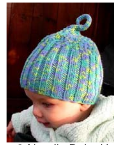
2-Needle Baby Hat