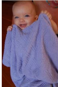
Diamond Pattern Blanket