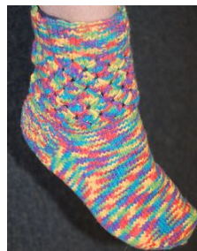
Quilted Circus Sock