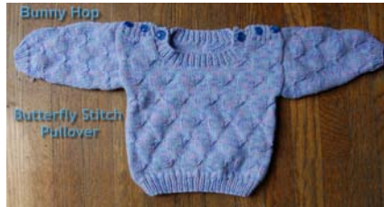
Butterfly Baby Sweater