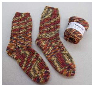
Bunny Hop Socks 2 balls