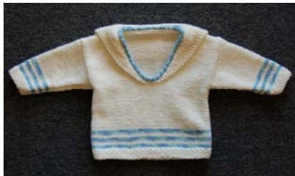
Baby Middy Shirt