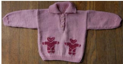
Teddy Bear Sweater