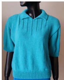
Pullover with Collar