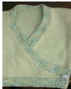
Baby Side Wrap Kimono