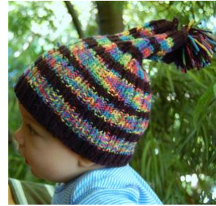
Reversible 2-size Baby Hat