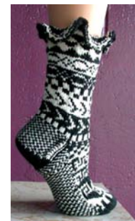
OP Art Bunny Hop Sock

There are 100s more free patterns on our web site and more are being added regularly – check the What's New page link at the top of any page at www.straw.com