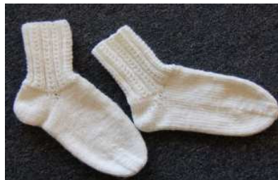
Lace Cuff Socks