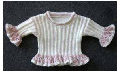
Baby Ruffled Top